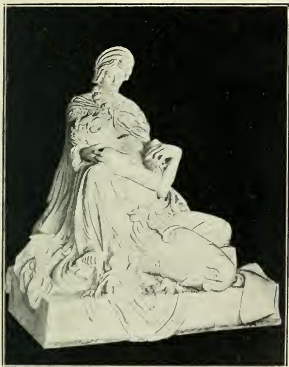
A MONUMENT TO PADRAIC PEARSE AND HIS COMRADES, SHOT IN EASTER WEEK